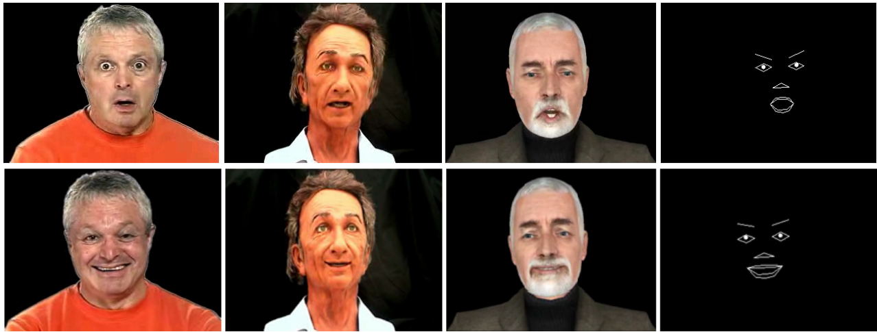
Figure 1: Still frames from eight of our 60 video stimuli. From left to right: the human actor, the physical android robot, the virtual avatar, and the stick figure animation. The top four videos show surprised , and the bottom four show happy .

tial frames, we split the Mind Reading DVD videos based on actors. Then we ran the FaceTracker on every video of the same person, which allowed us to determine their average facial appearance. Some examples of facial appearance features are: distance between inner eye corner to inner brow, mouth width, mouth height, distance from the point between the eyes to the centre of the mouth, etc.