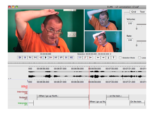
Fig. 1. A screenshot of the ELAN annotation tool [66], which we used to annotate the interview.

During the interview sessions, three cameras were trained on the interviewee. One camera directly faced the subject, and the other two were placed on the left and right about 2 meters away, at a 45 degree angle [57]. We also used a Tobii infrared