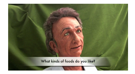
Fig. 2. A screenshot from the stimulus video, depicting an "ice-breaker" question the participant is primed to ask.

We then had an eight-minute long video consisting of two parts. We used this to create two stimuli videos for our experiment. The first video, Video 1, consisted of the entire eight-minute long video of S2 (both Part I and Part II). The second video, Video 2, consisted of Part I depicting our robot "playing back" S2's head movements and facial expressions (4 minutes), followed by the original Part II video (4 minutes).